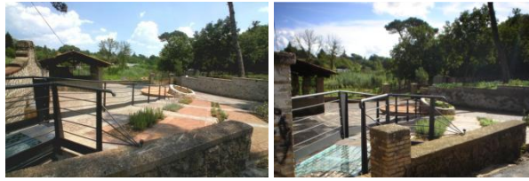
2016 Heng Tai Office Design (built)