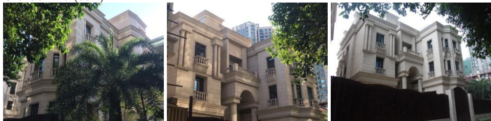
2004 Italy CAVE Piazza Santo Stefano (built)