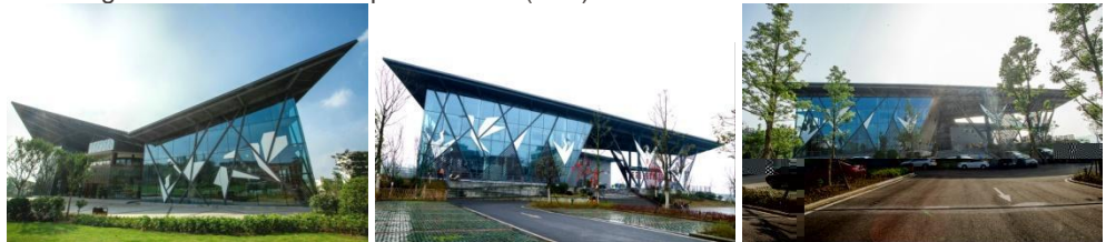
2014 Fortune Plaza Landscape design (built)